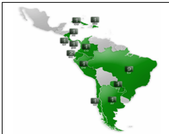
Figure 2: Internet Exchange Points in Latin America, presented by Roque Gagliano, NAPLA.

Implementing and maintaining carrier-neutral facilities can be a costly venture. Cost elements include power, air-conditioning, security, floor space rental, and staffing, among others. Basic membership fees and port charges are usually levied on IXP participants to offset operational costs. It was noted that surplus revenues, which can result from a growth in IXP membership, are often reinvested in facility enhancements and new services.