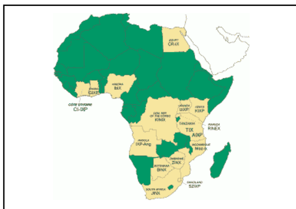
Figure 3: Internet Exchange Points in Africa, presented by Michuki Mwangi (data courtesy the Network Start Up Resource Center)